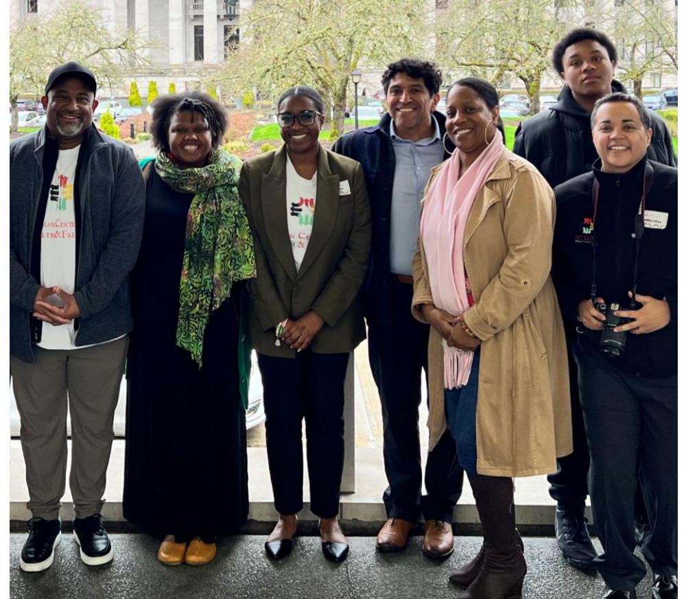
Tubman Center for Health and Freedom