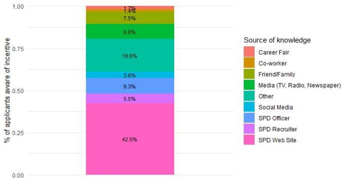
Chart 2. How Applicants Find Out about the Incentive.