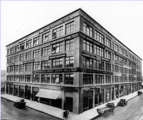
Historic photo, 1911