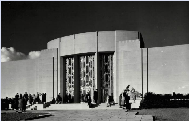
Historic photo, 1933