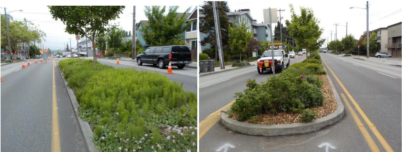
Greenwood medians work (before and after)