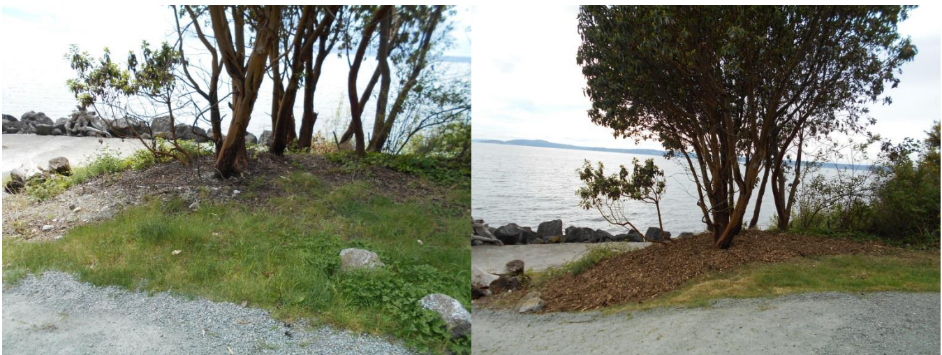
McGraw (before and after)