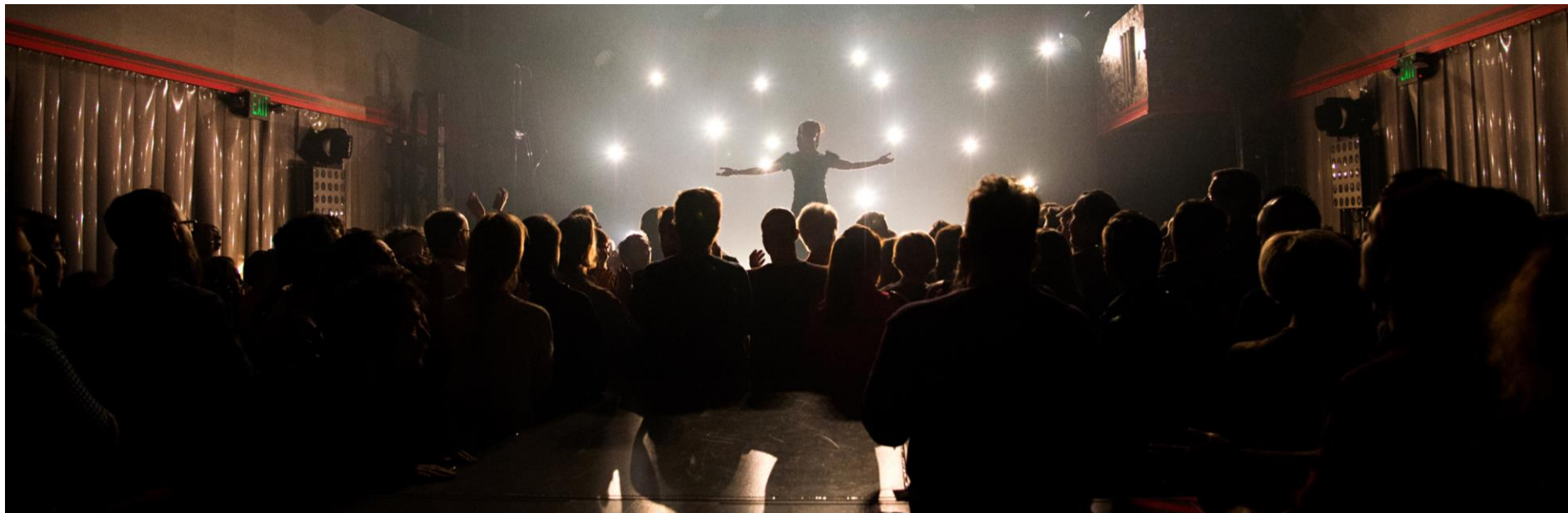
Here Lies Love Funded by Civic Partners

Our grant programs make meaningful impacts by expanding access to arts and culture for residents and visitors of all ages throughout the city, building capacity of individual artists and arts organizations.