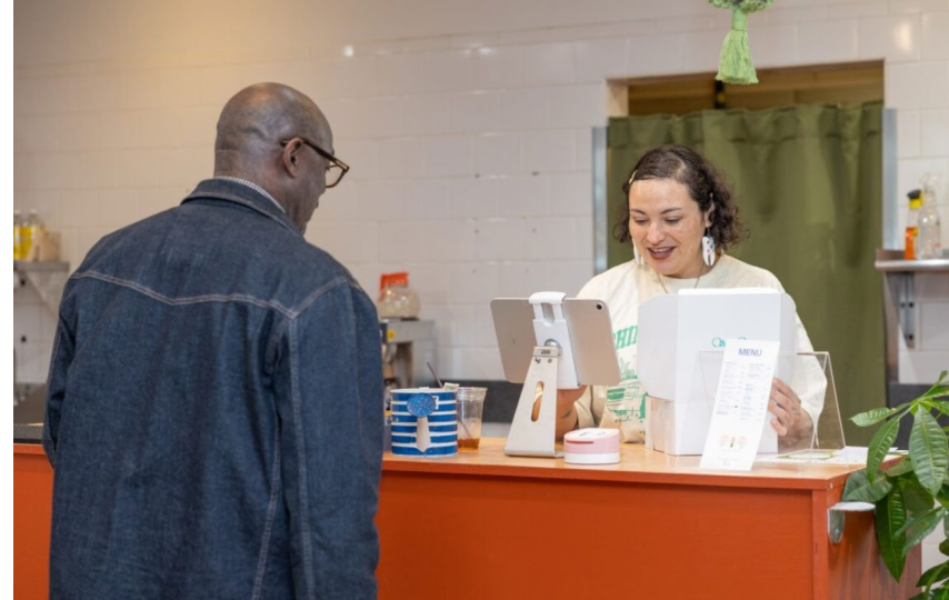
Pan de La Selva