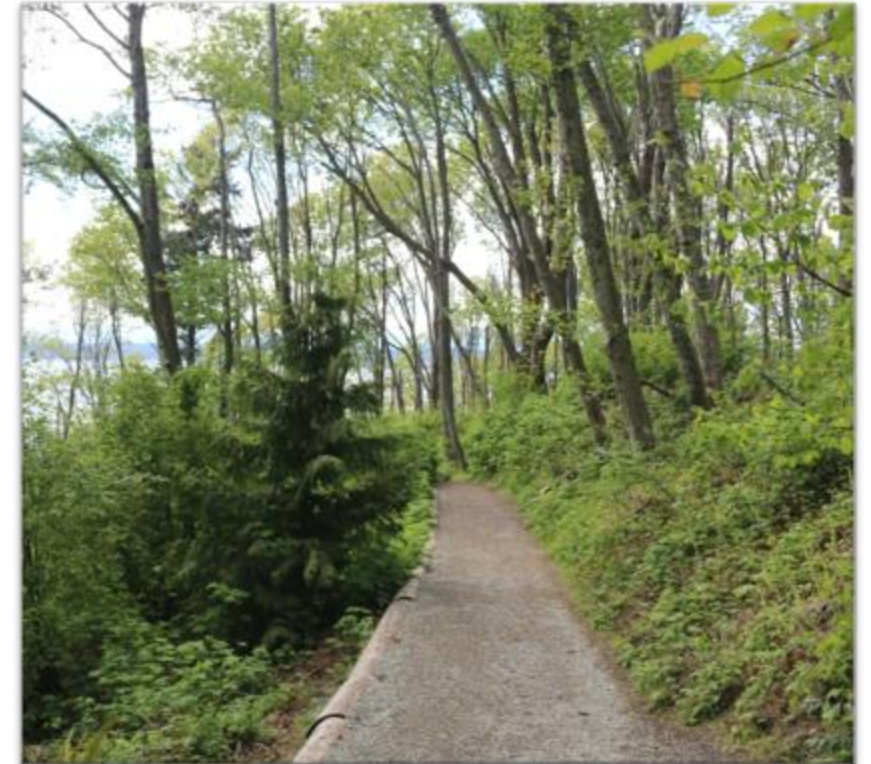
Discovery Park South Beach Trail