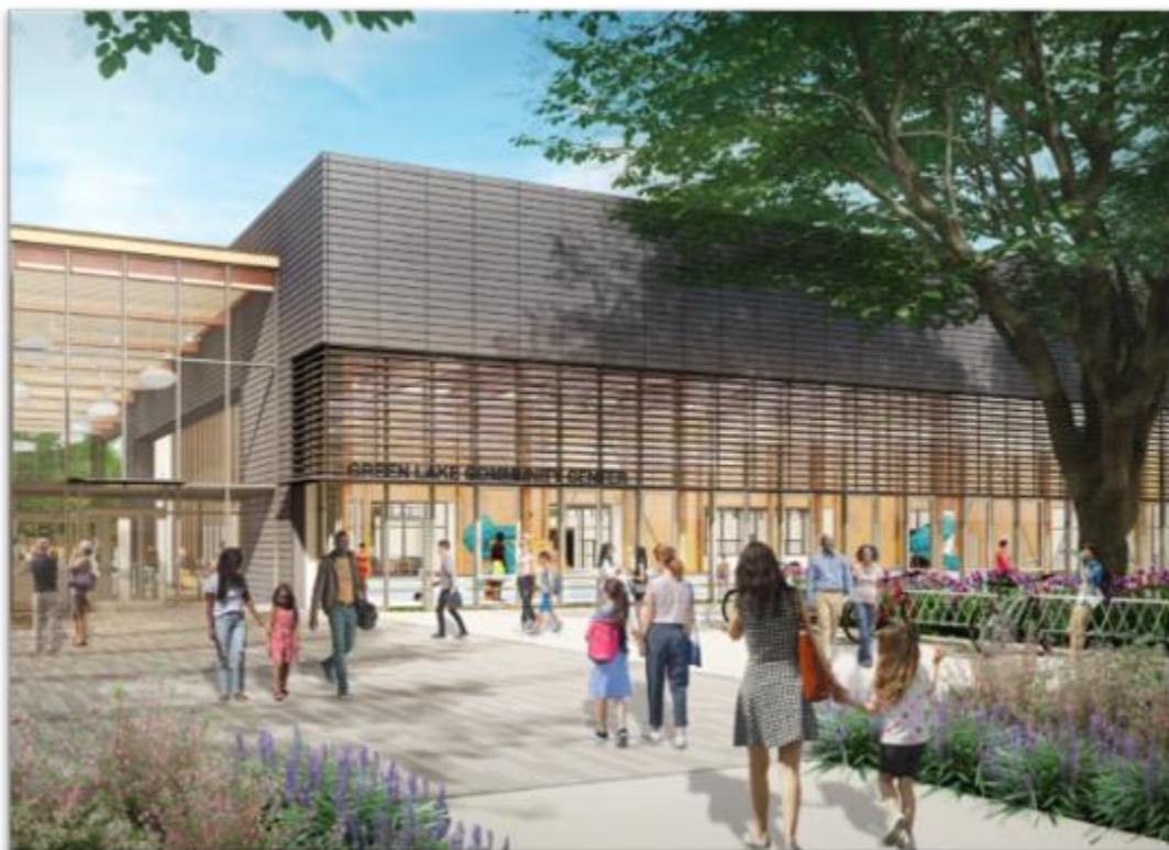
Evans (Green Lake) Pool Redevelopment

SPR would like to apply for $24,000,000 in funding for 7 projects through RCO grant programs: