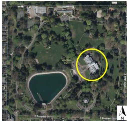
Seattle Asian Art Museum Building