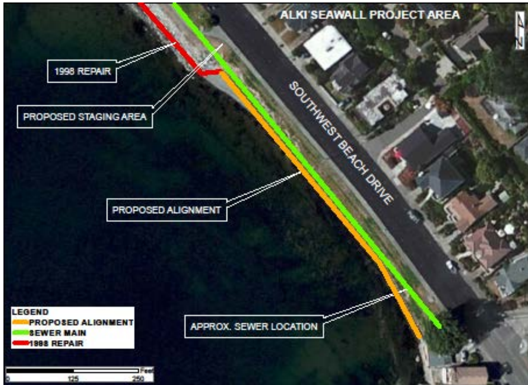
Figure 2. Site Overview