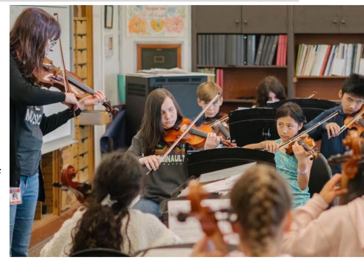
Orchestra students rehearse at Jane Addams Middle School in Meadowbrook