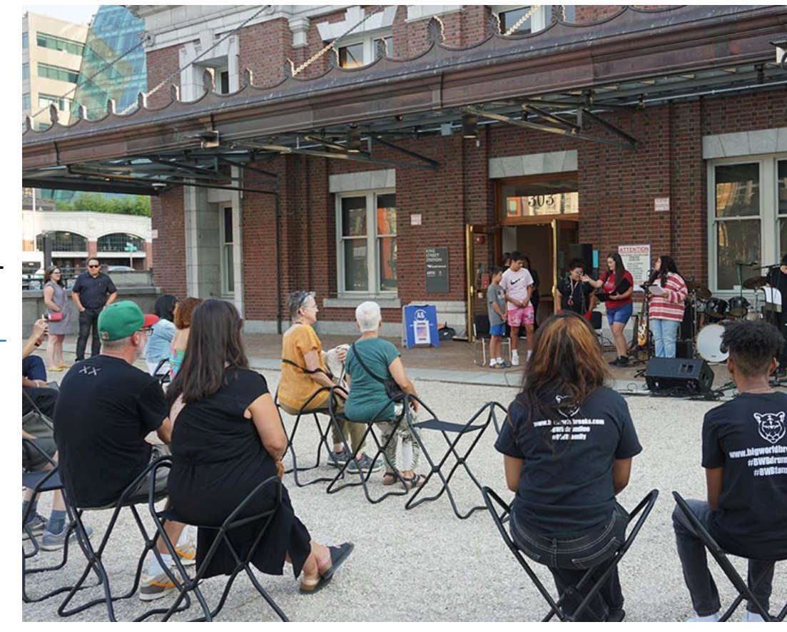
Red Eagle Soaring at Station Space Block Party in King Street Station plaza