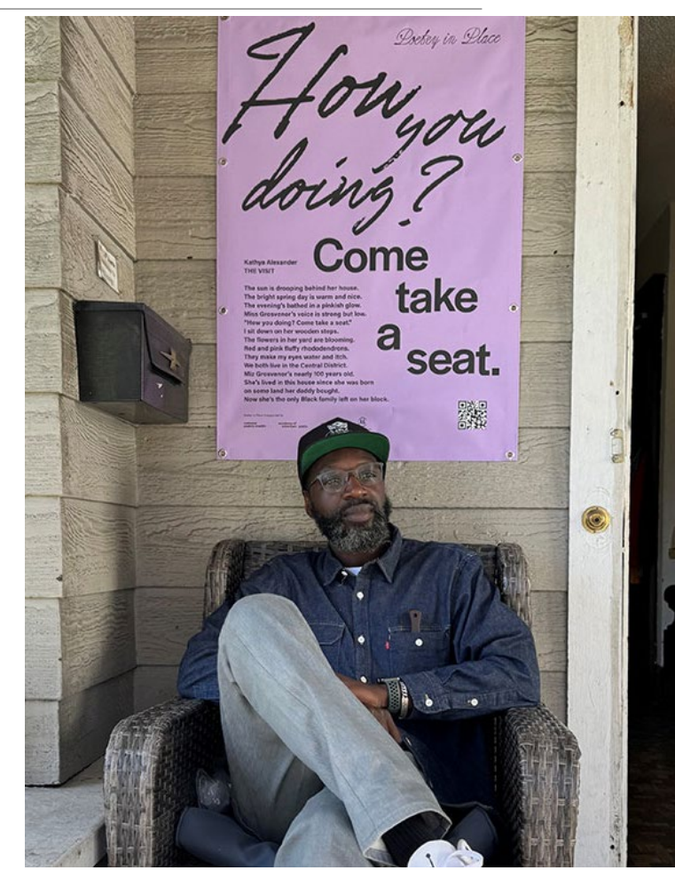
Seattle Civic Poet project at Wa Na Wari