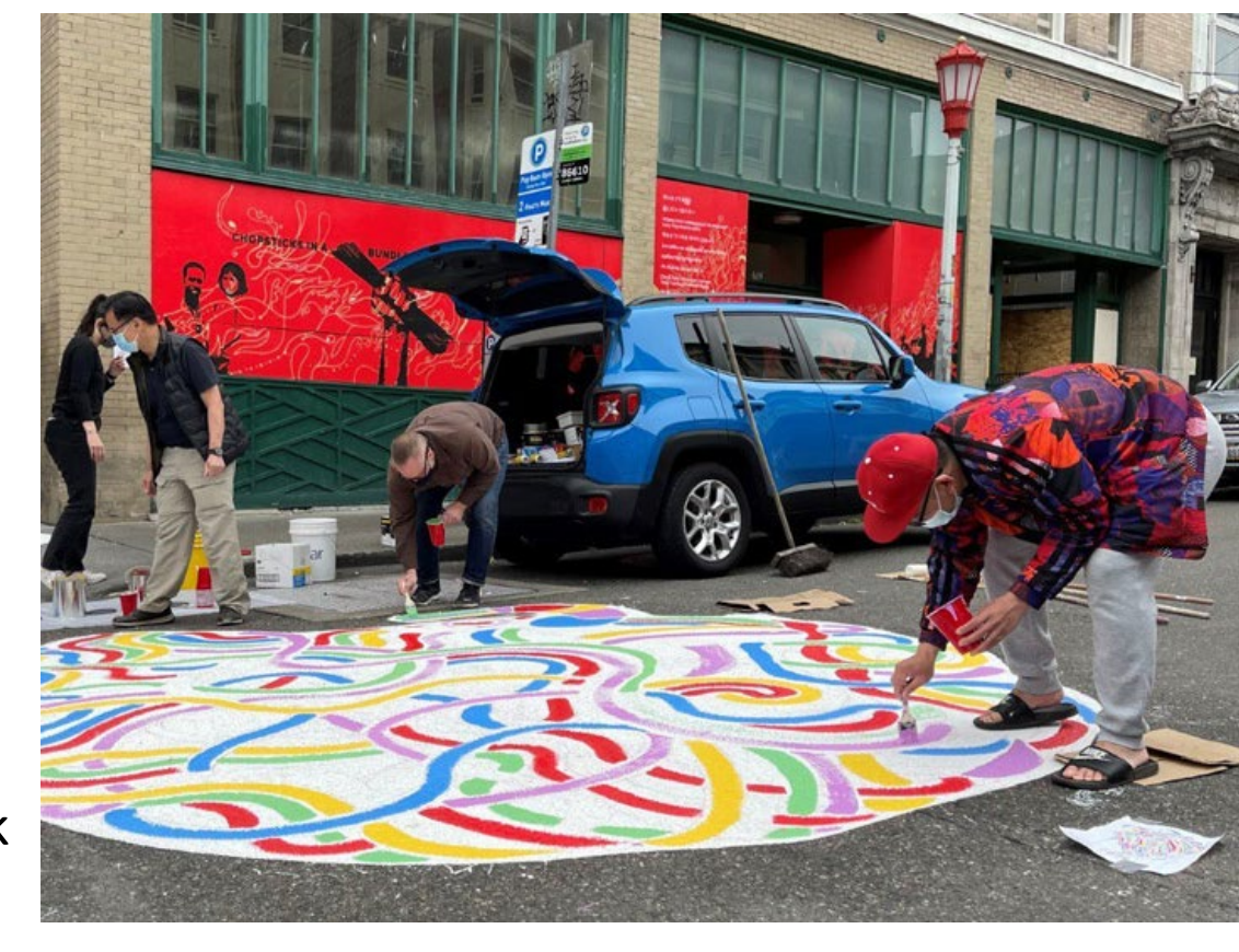
SLURP! mural in Maynard Alley by Akira Ohiso

CHANGE FROM 2024 ADOPTED ($000s) 2025 Proposed Arts & Culture Fund $2,529