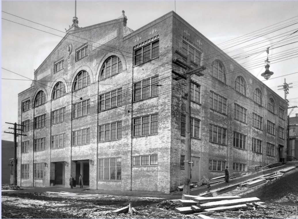
2200 Western Avenue