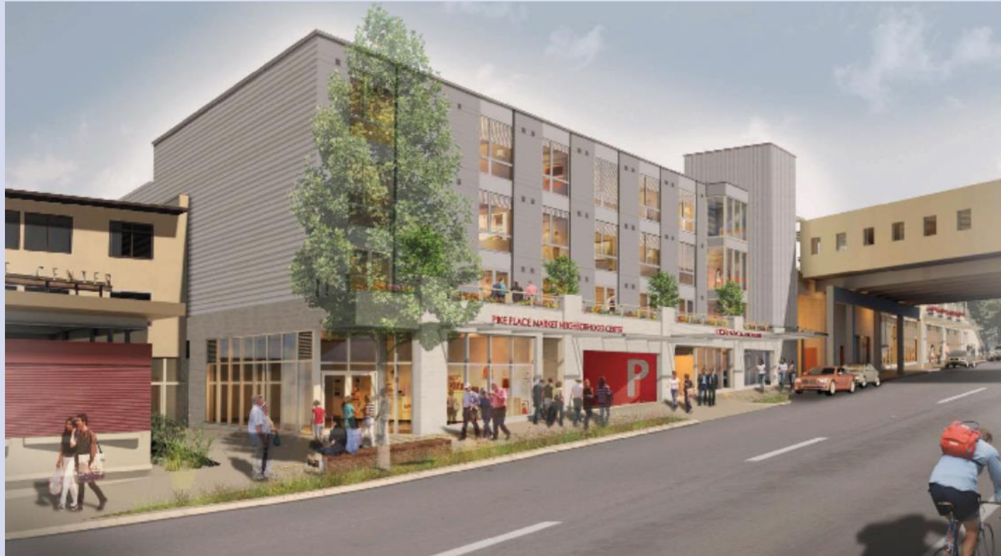
Market Front Building, 1901 Western Avenue