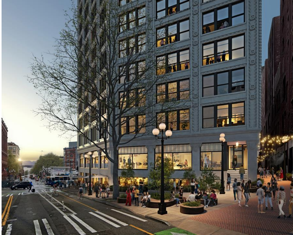
Figure 5 Smith Tower Conversion Visualization