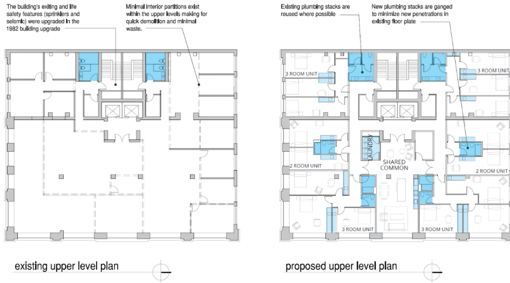
Figure 4 Existing and Proposed Plans