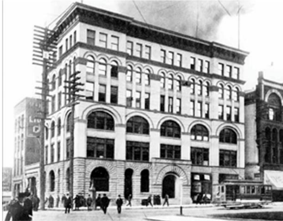
ORIGINAL PHOTO (1903)

The proposal prioritizes the preservation of existing facades and historic features. Since adding plumbing is a major cost driver, it would create a floor plan where several sleeping rooms share bathrooms. Each level features communal kitchen, living, and laundry facilities. The proposer suggests that rents could be at similar prices to some rent-restricted affordable housing buildings.