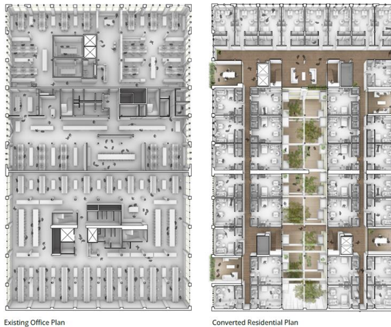
Figure 2 Existing and Proposed Plans