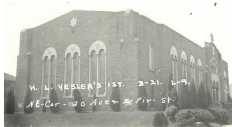
Historic Photos, 1938 (left) and 1979 (right)