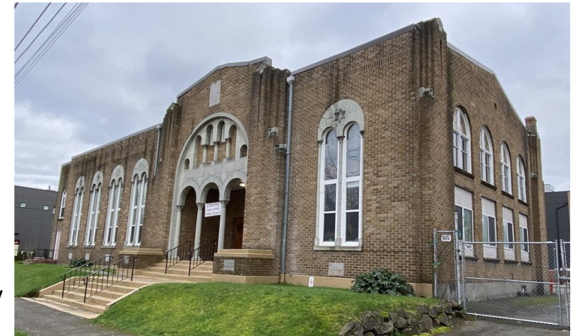
Contemporary Photo, 2020