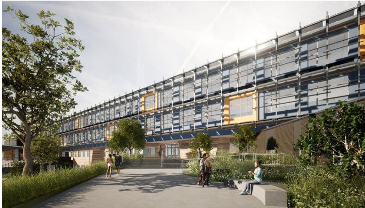
Future Design Rainier Beach HS Rendering