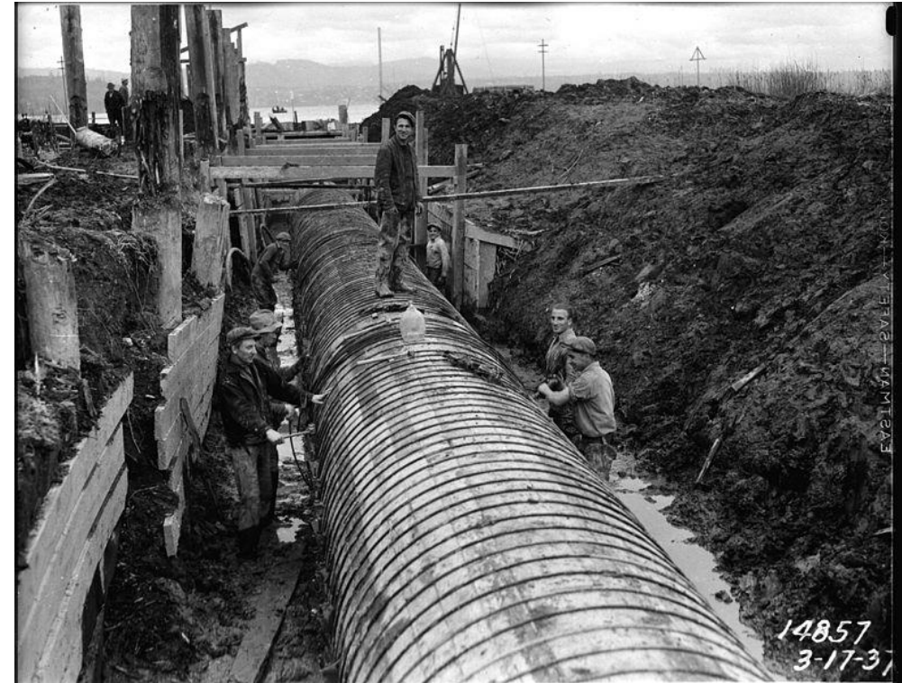
Workers on Henderson Street trunk sewer, 1937