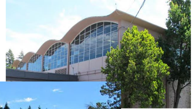
Contemporary photos, 2017