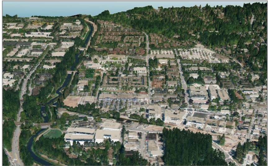
LiDAR point cloud colored by NAIP imagery of downtown Redmond, Washington.

Quantum Spatial, Inc. appreciates the opportunity to present to the Puget Sound LiDAR Consortium (PSLC) a cost proposal for acquiring and processing high-resolution (> 8 pulses/m 2 ) LiDAR data for the project area of interest to King County, WA. Our cost for LiDAR acquisition and processing abides by our negotiated cost structure with the PSLC, assuming that a contract for standard deliverables will be administered through Kitsap County, WA.