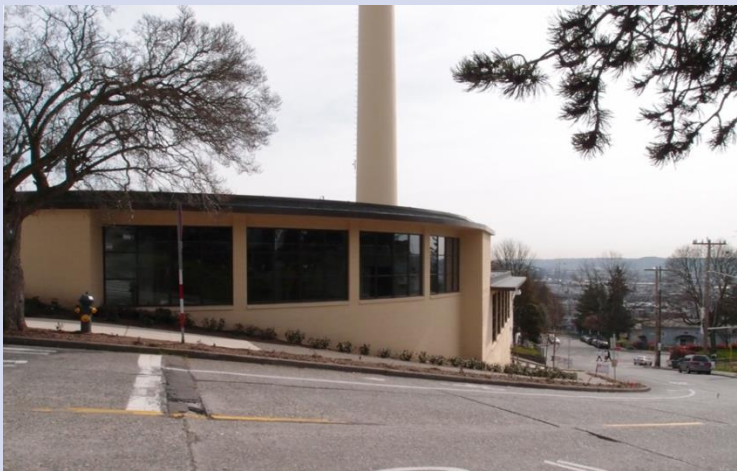
Contemporary photo, 2014