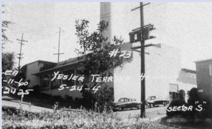
Historic photo, 1960