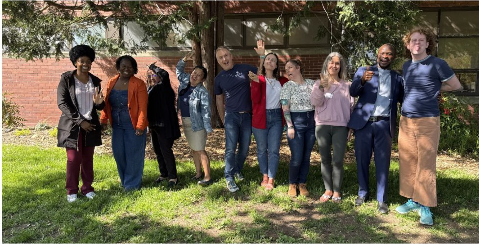
2025 DWSB Retreat with Ibelong Consulting