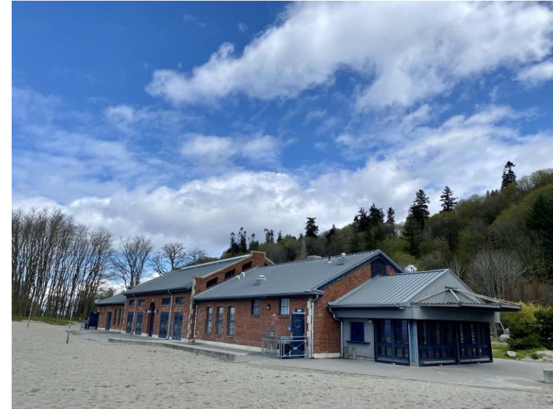
Golden Gardens Bathhouse, circa 2023