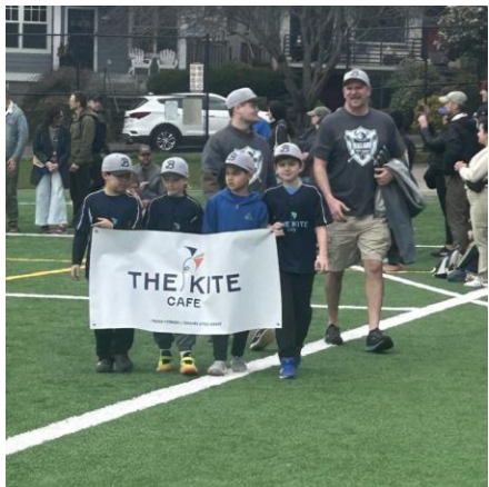
Ballard Little League