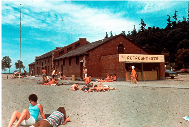
Golden Gardens Bathhouse, circa 1969