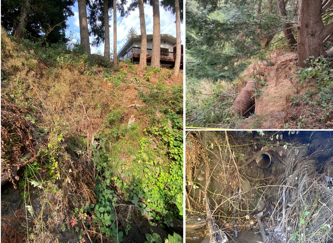
2022 – unstable slope & failing culvert