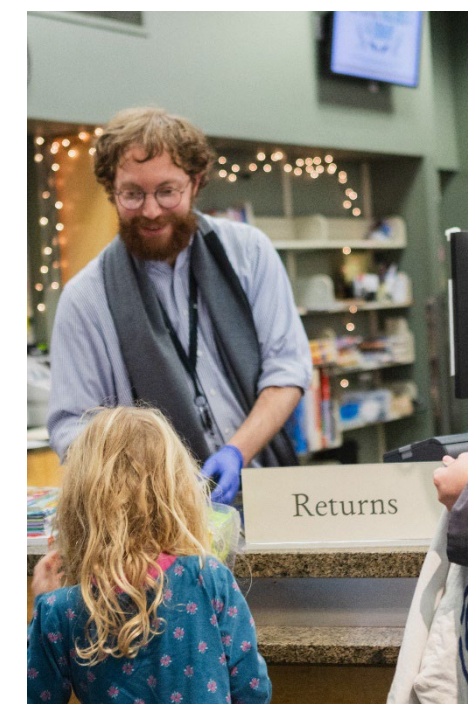
OPEN HOURS & ACCESS