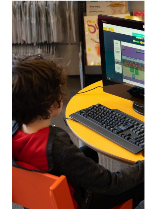
TECHNOLOGY & ONLINE SERVICES