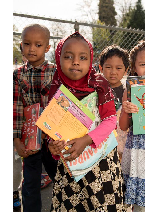
HELPING CHILDREN: LITERACY & ENRICHMENT