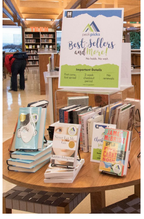
BOOKS & MATERIALS