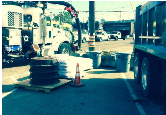
Relocated material storage increases truck loading times