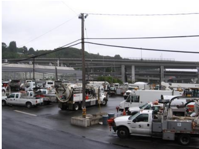
Compact parking restricts vehicle mobility