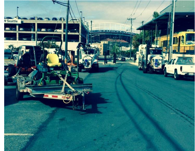
Streetcar maintenance building interrupts crew operations