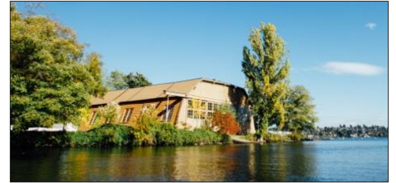
Contemporary photo, 2017