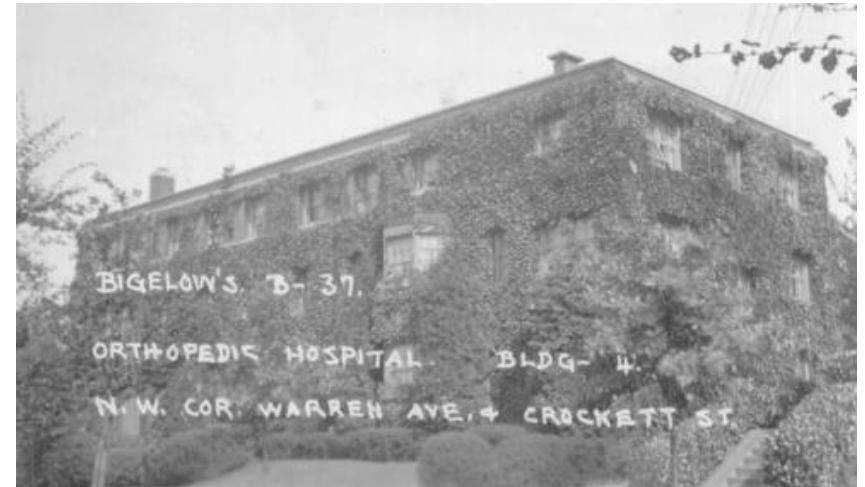
Historic photo, 1937