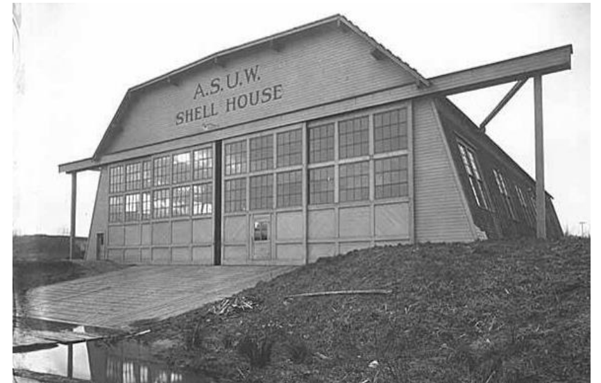
Historic photo, 1923