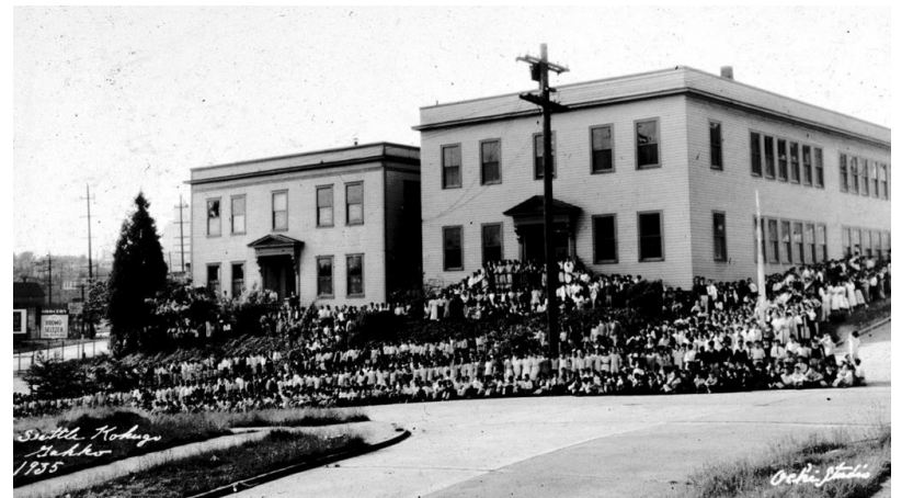
Historic photo, c.1935