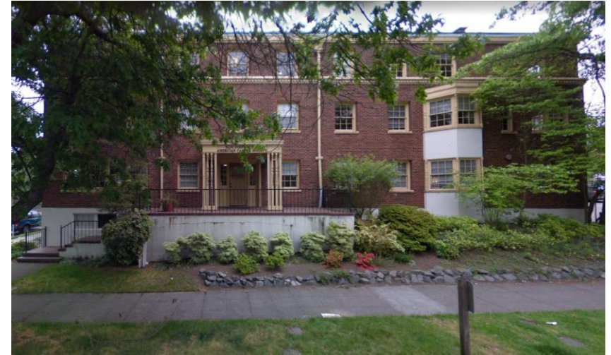
Contemporary photo, 2018