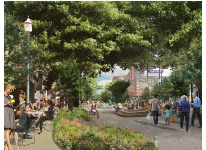
A vision for the Ave's future.