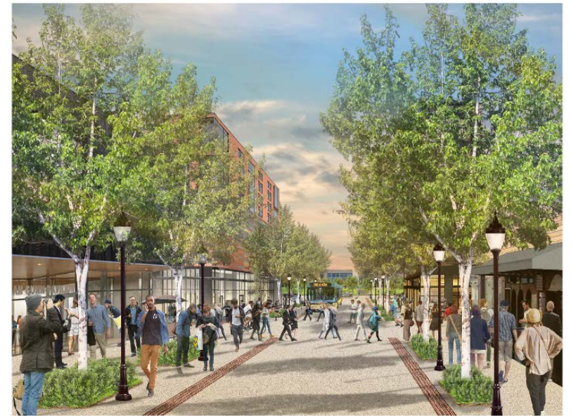
Figure 32. Conceptual illustration of NE 43rd Street looking east toward the campus.