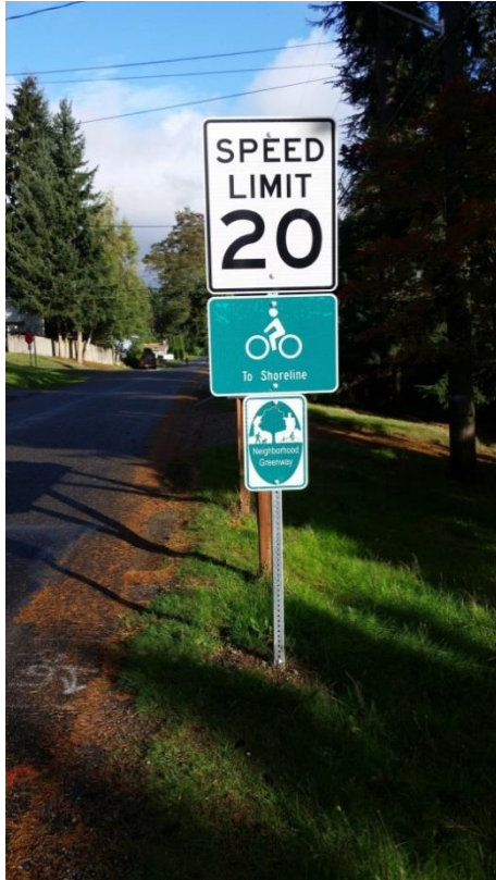
Neighborhood greenway designation