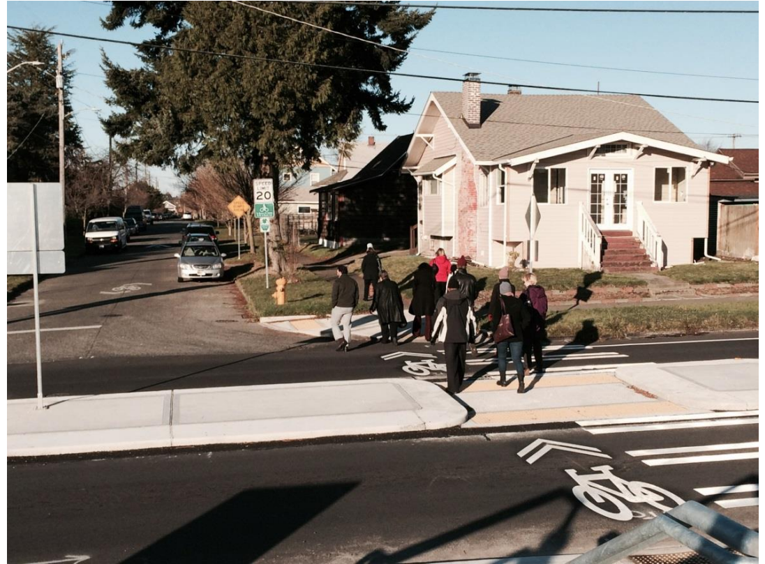
New neighborhood greenway – Spokane & Lafayette