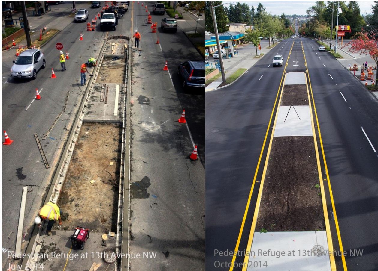
Holman Road Paving project before/after – pedestrian refuge at 13 th Ave NE