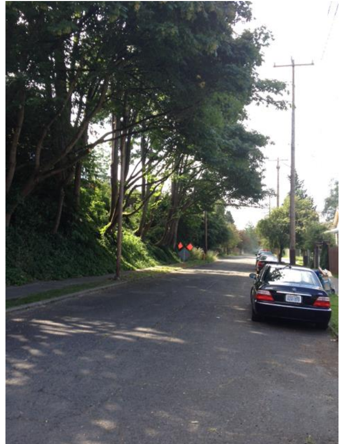
Tree pruning before/after – Central District