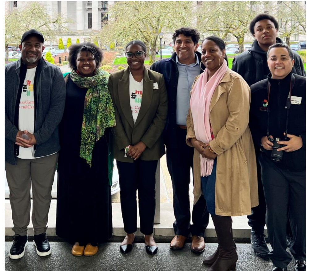
Tubman Center for Health and Freedom