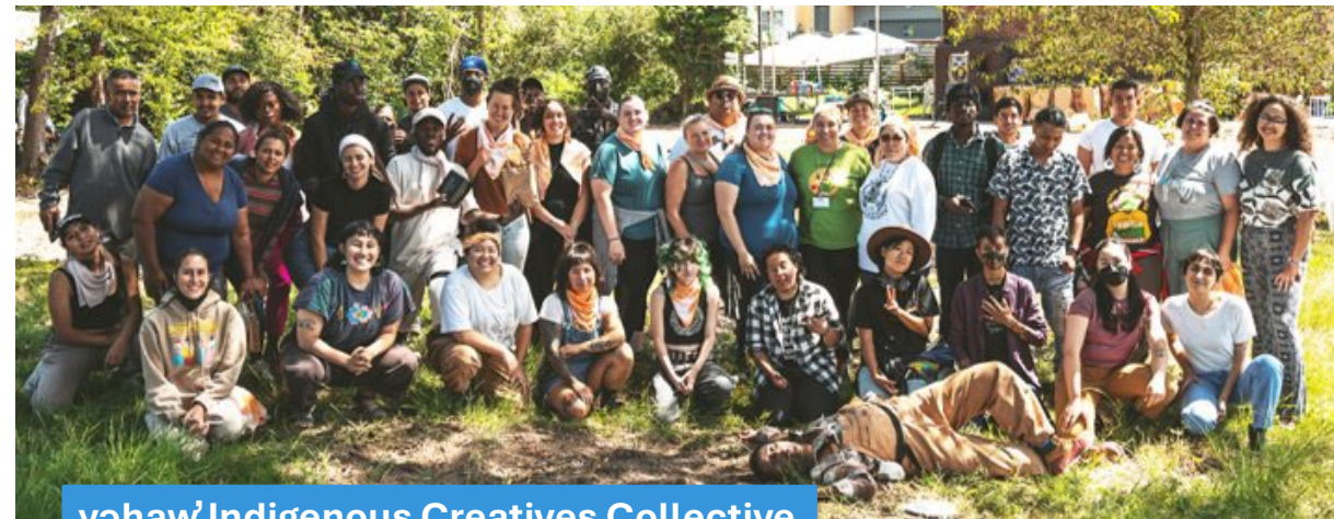
yəhaw' Indigenous Creatives Collective