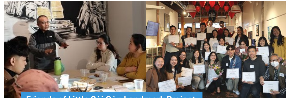
Friends of Little Sài Gòn Landmark Project