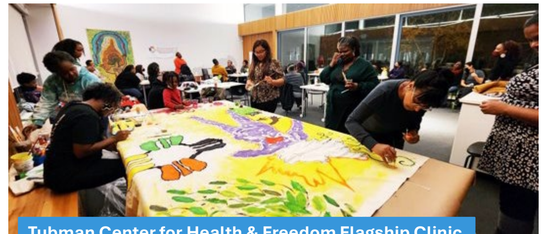
Tubman Center for Health & Freedom Flagship Clinic