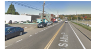
Existing: S Albro St