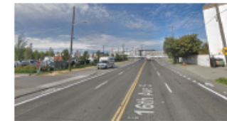
Existing: 16th Ave S (north of South Park Bridge)