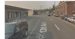
Existing: 13th Ave S