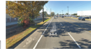
Existing: E Marginal Way S