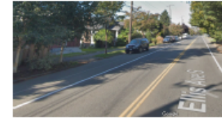
Existing: Ellis Ave S