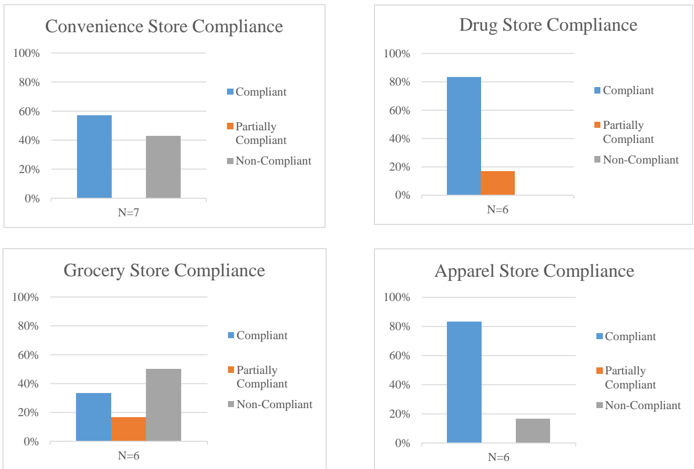
Figure 2. Bag Ban Inspections Results by Sector

Compliance with Seattle’s bag ban is essential if the City is to minimize the number of plastic bags entering our waterways and waste streams. An SPU inspector visited a random sample of 25 Seattle businesses from four retail sectors to determine compliance with the bag ban ordinance. Each business was determined to be either compliant, partially compliant, or non-compliant. Compliant businesses do not use plastic bags and charge at least five cents for large paper bags (882 cubic inches or larger). Partially compliant businesses do not use plastic bags, but also do not charge the required five cents for large paper bags. Non-compliant businesses use plastic bags. The figure below summarizes the data from those inspections. More extensive results can be found in the Appendix, Table 1.