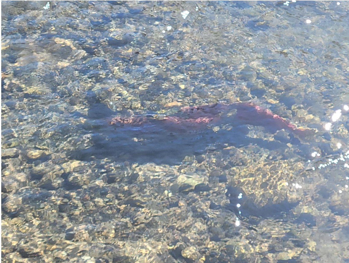
Sockeye salmon spawning in Royal Arch new project channel, Sept 2023