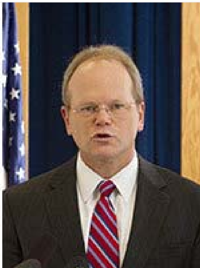
Dan Satterberg is King County's prosecuting attorney.

have the opposite effect for crime victims.