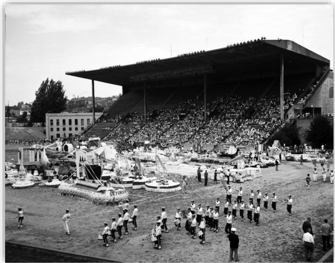
Seafair parade at Memorial Stadium, July 30, 1960

Today's opportunity is to create a future legacy with a new world-class student and community stadium through a partnership with SPS, One Roof Stadium Partnership, and the City.