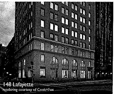
148 Lafayette rendering courtesy of Cook + Fox