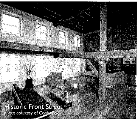
Historic Front Street