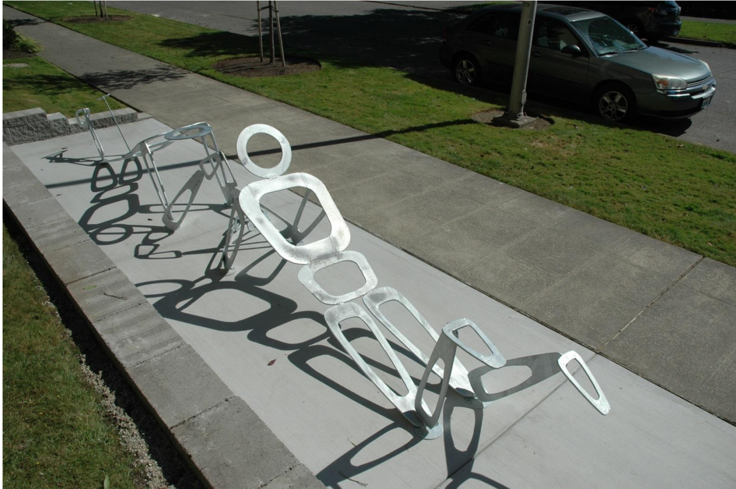
Specialty bike rack