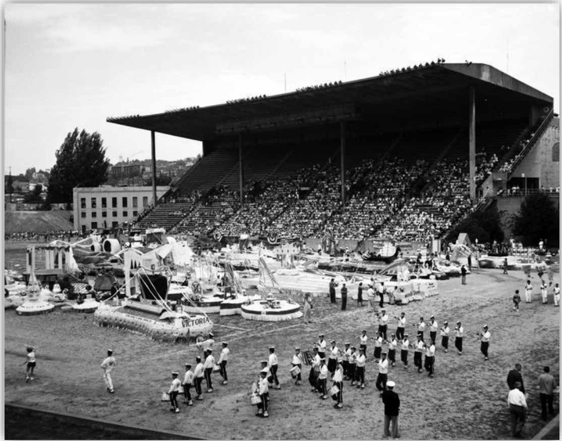
Seafair parade at Memorial Stadium, July 30, 1960

Today's opportunity is to create a future legacy with a new world-class student and community stadium through a partnership with SPS, One Roof Stadium Partnership, and the City.