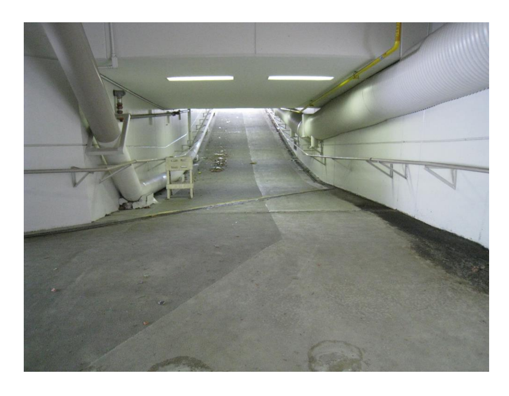
Tunnels were first permitted in 1955