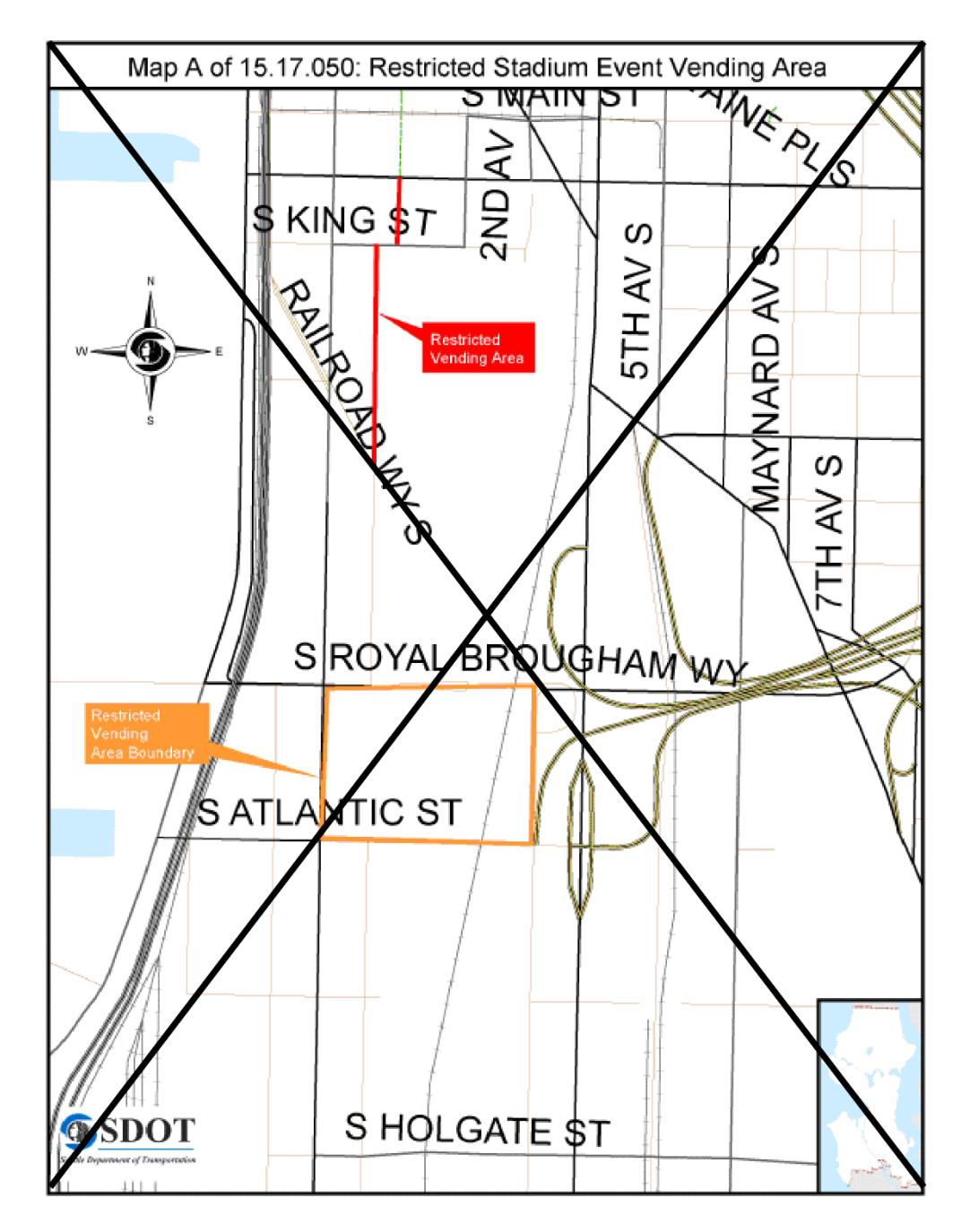
B. The Director of Transportation may adopt rules relating to the vending of newspapers, magazines, event programs, and other similar publications on foot in the Restricted Stadium Event Vending Area. These rules may, among other subjects, address issuance and duration of Street Use permits, number and location of the on-foot vendors, advertising and posting of