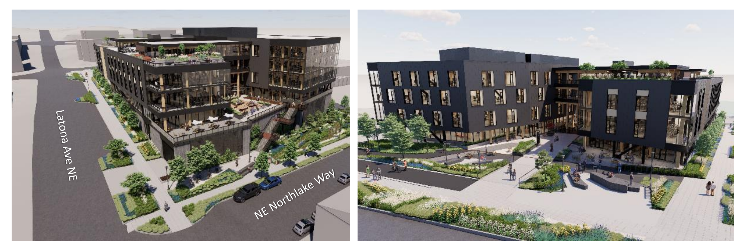
Looking northeast at 3800 Latona Ave NE