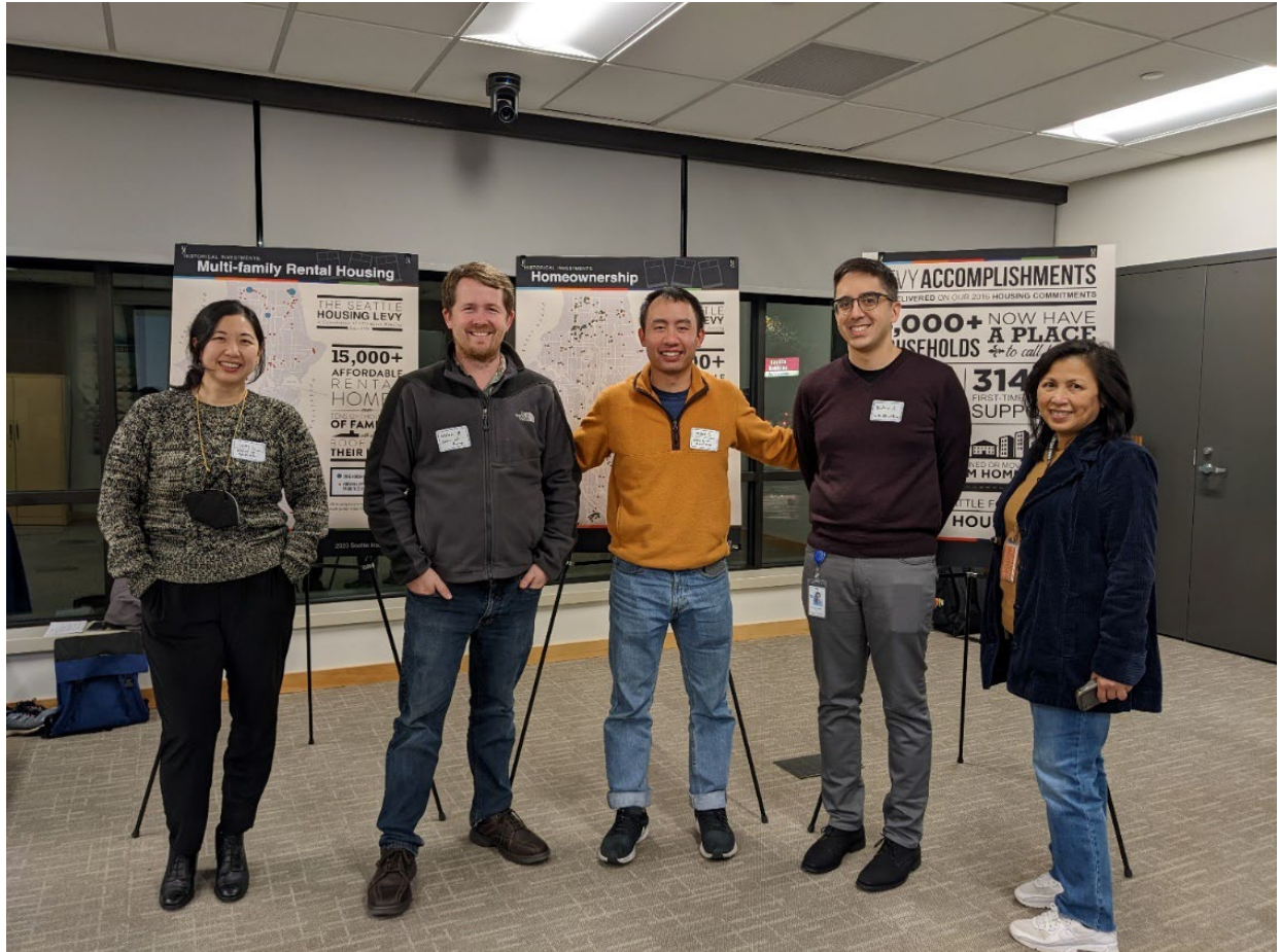
Housing Levy Open House at Hobson Place, December 6, 2022