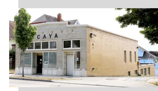
Central Area Youth Association (CAYA)