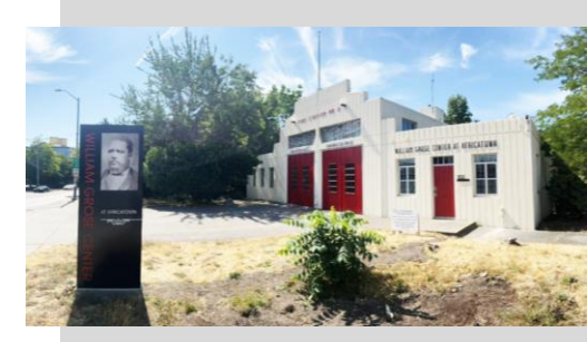
William Grose Center for Cultural Innovation Africatown