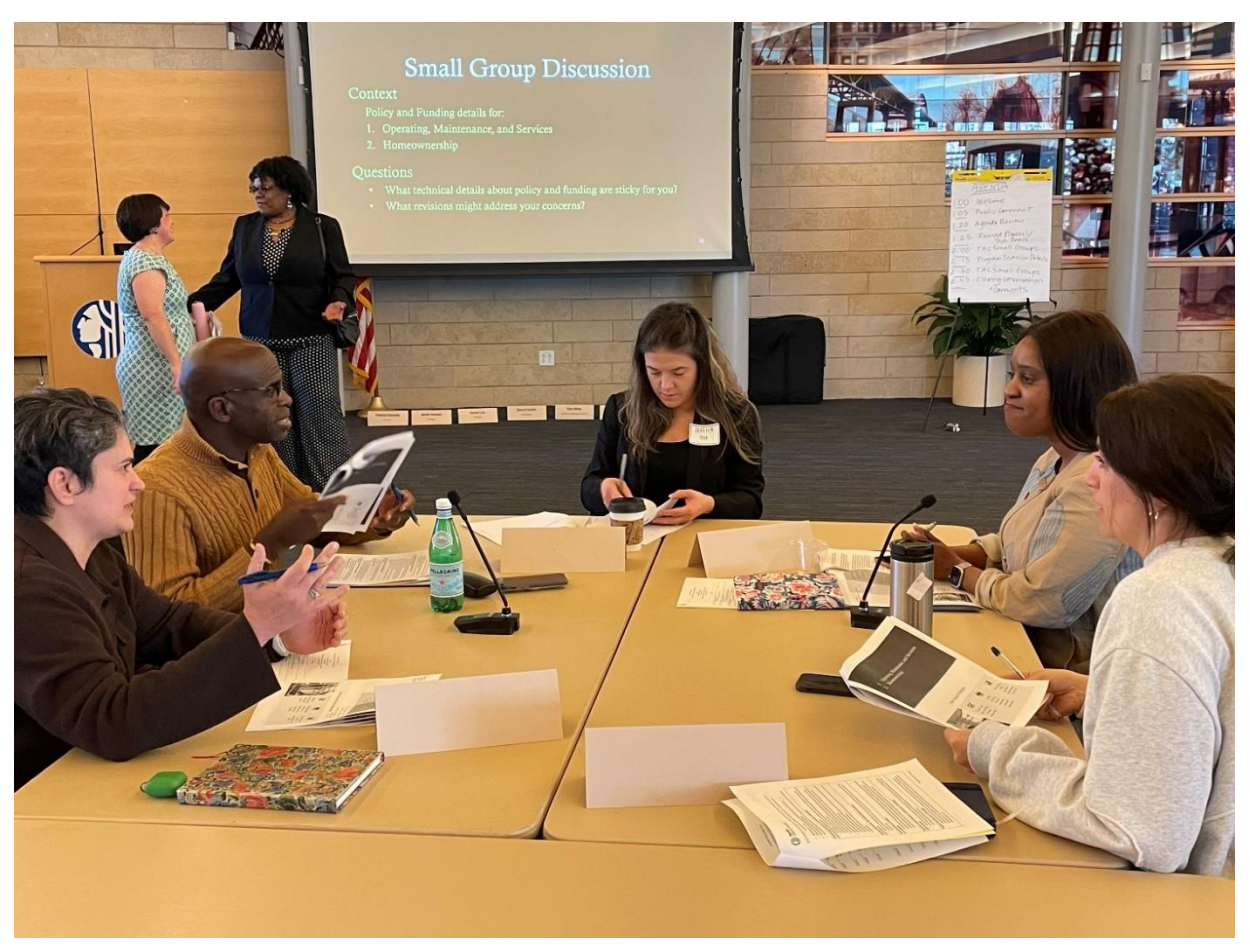
Housing Levy Technical Advisory Committee meeting, November 18, 2022