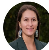
Asia Tail (Cherokee)