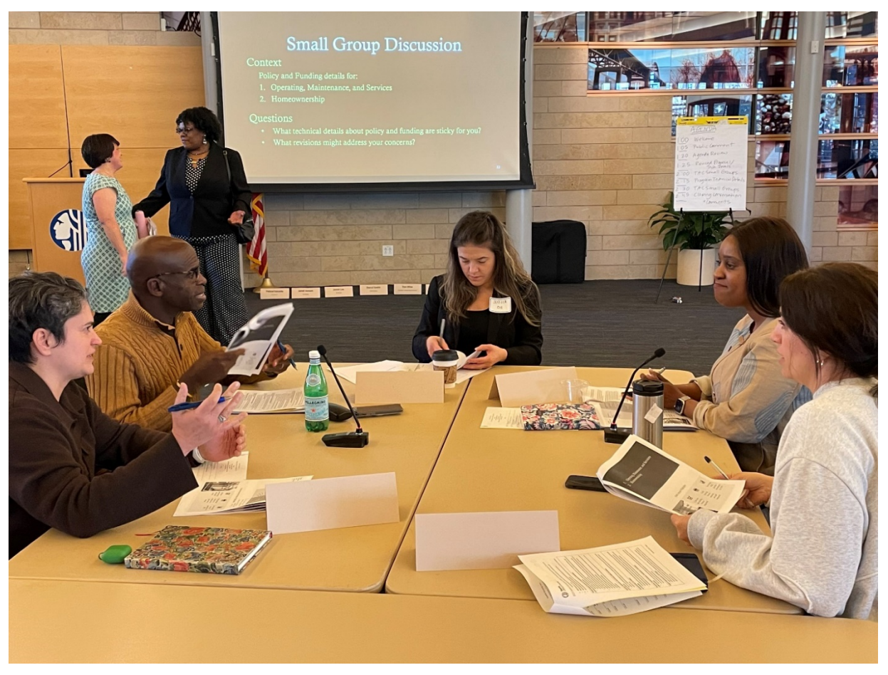
Housing Levy Technical Advisory Committee meeting, November 18, 2022