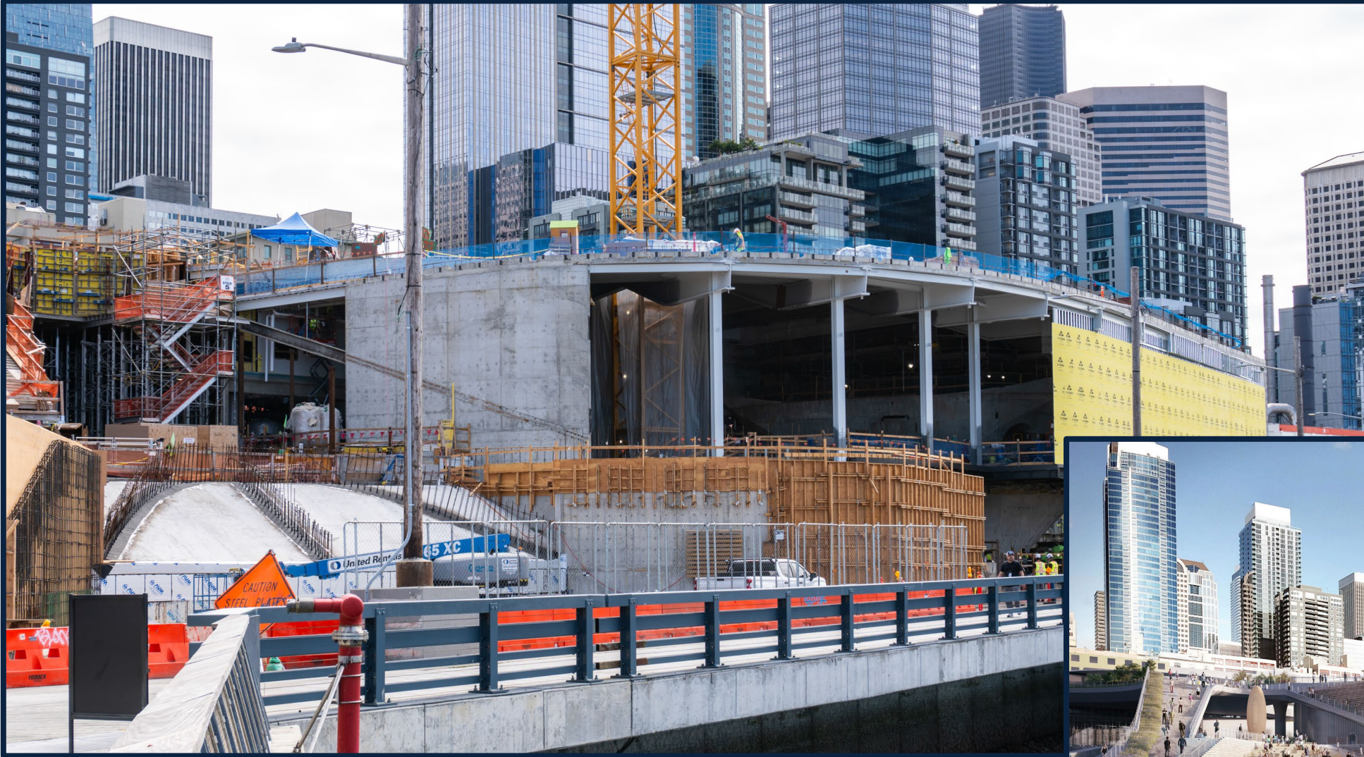
Salish Steps and Ocean Pavilion view southeast