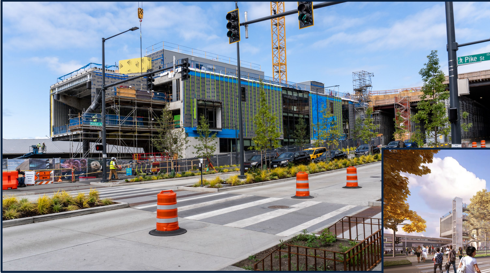
Alaskan Way view west