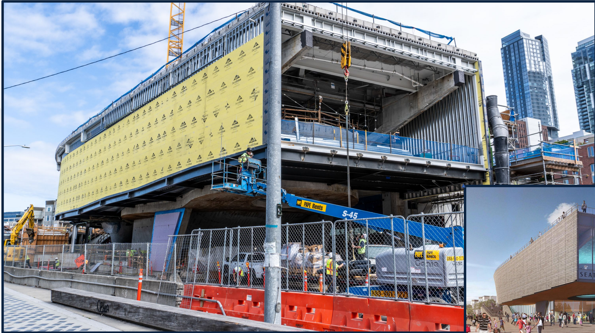
Ocean Pavilion view north