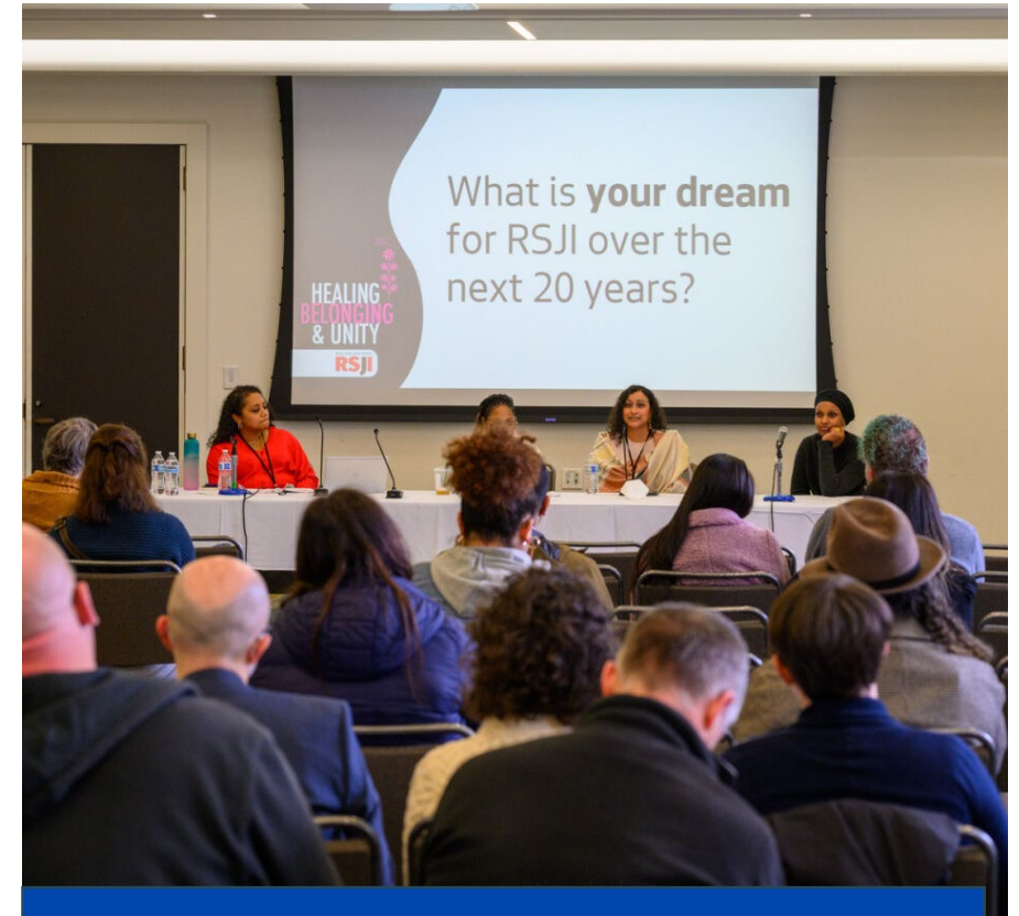
Image depicts an audience listening to a panel discussion at the 2023 RSJI summit on the topic of the RSJI Ordinance.