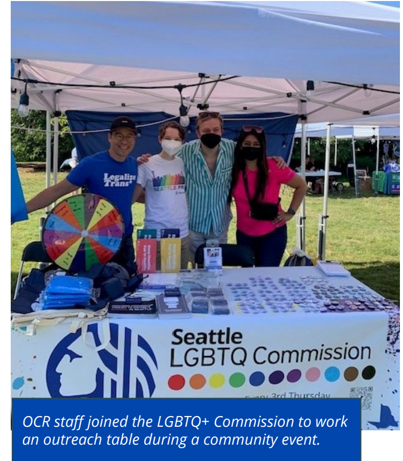
OCR staff joined the LGBTQ+ Commission to work an outreach table during a community event.