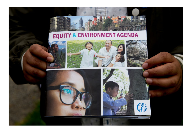
A blueprint for advancing race & social justice in Seattle's environmental work