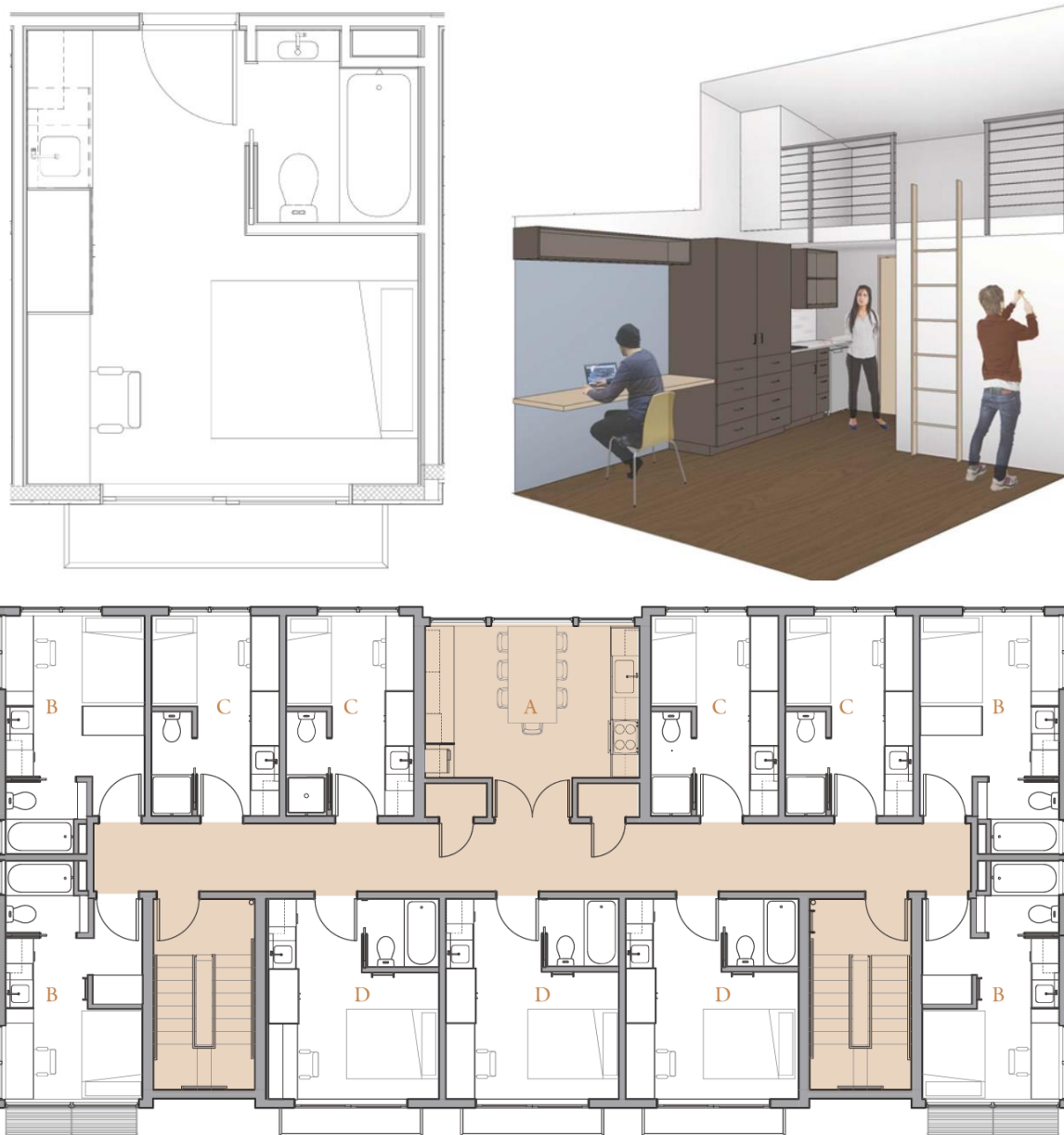
Figure 5: Yobi building visualization of loft space, and upper level floor plan. Credit Neiman Taber Architects.