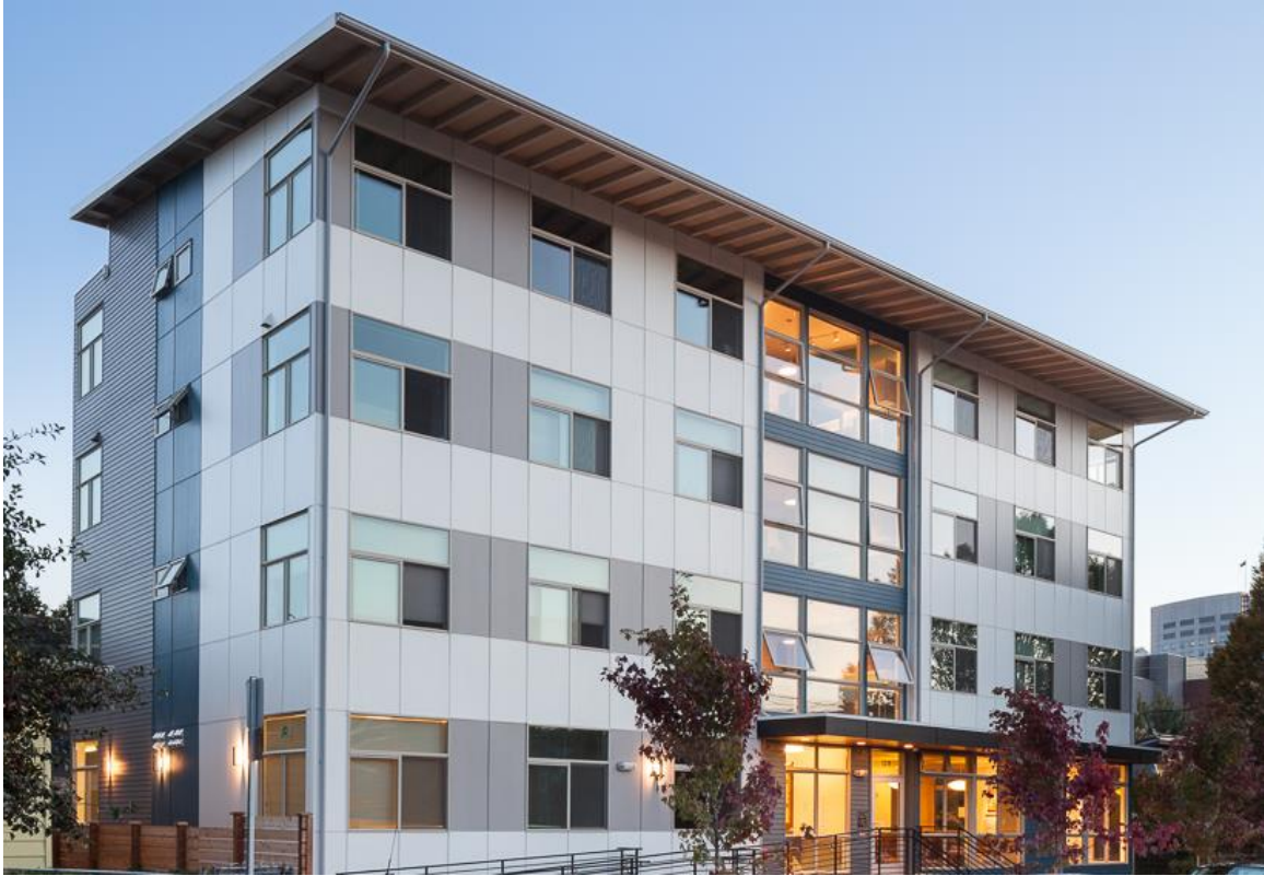
Figure 4: Yobi building. Credit Neiman Taber Architects.