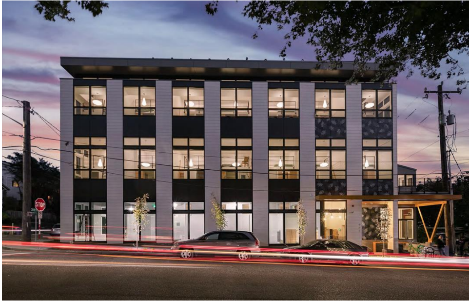
Figure 6: The Roost building. Credit Neiman Taber Architects.