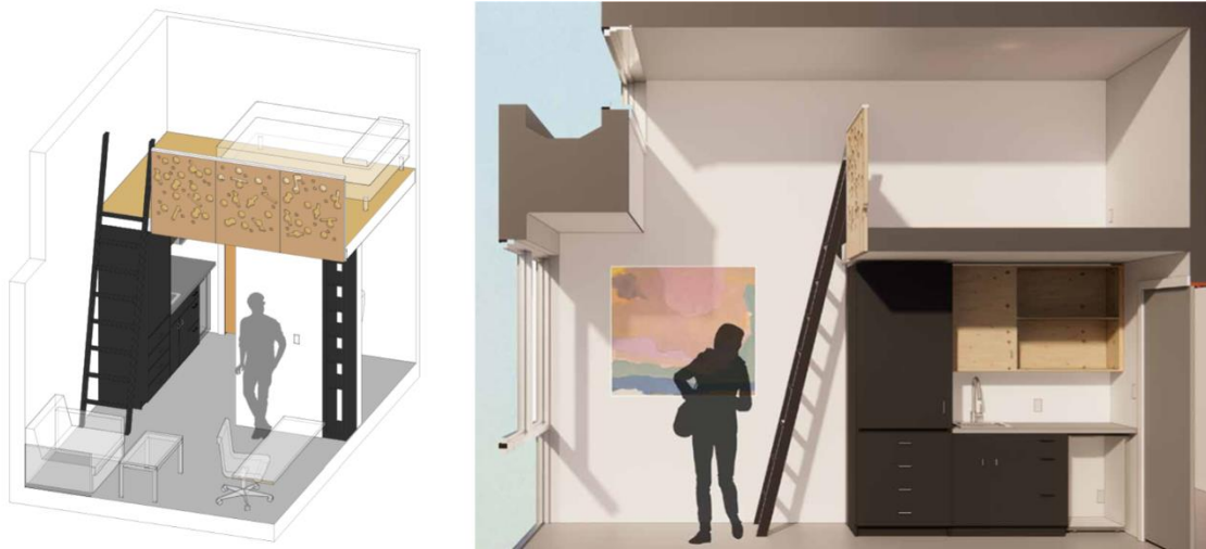
Figure 2: Karsti apartment building rendering of sleeping loft. Credit Neiman Taber Architects.