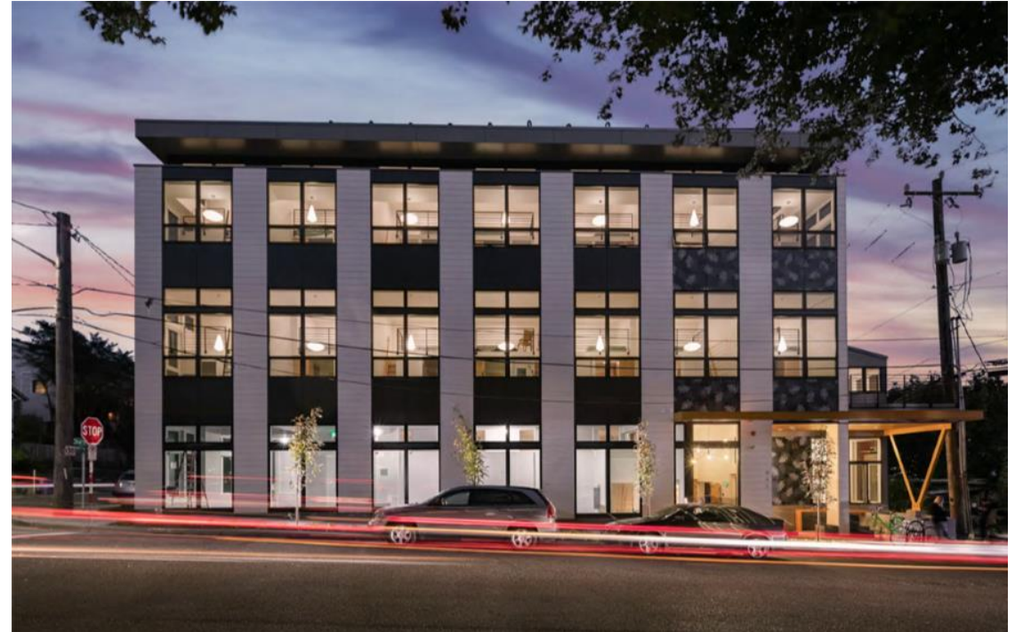
The Roost building. Credit Neiman Taber Architects.