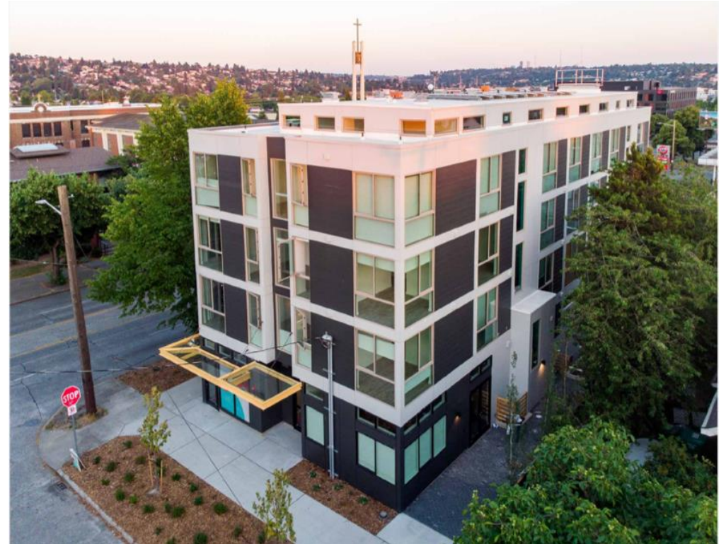
Karsti apartment building. Credit Neiman Taber Architects