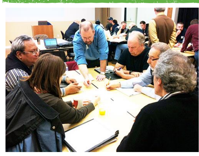
Energy Code Workshops and Trade Shows