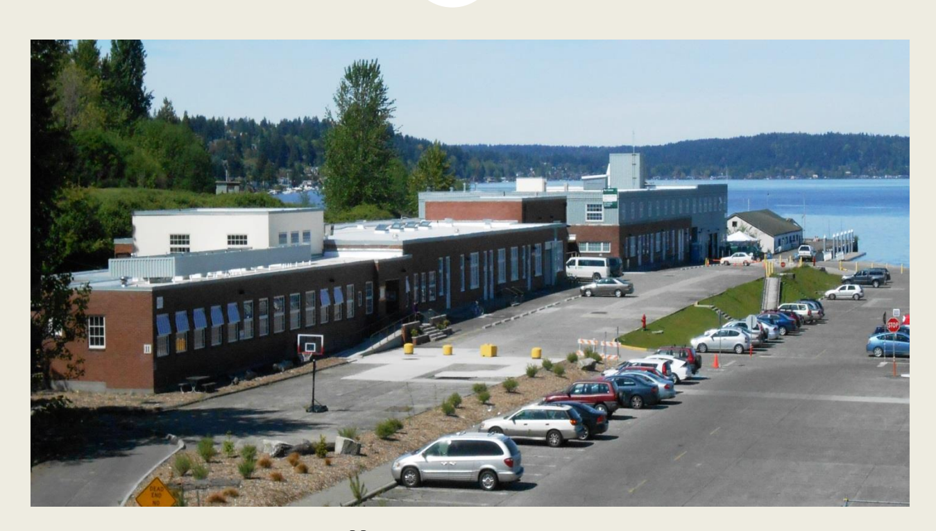
Oiselle Running, Inc. Building 11 – Magnuson Park